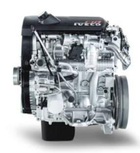
2.3-litre FIA Diesel engine