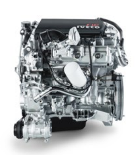
3.0-litre FIC Diesel engine

The double SCR technology ensures Euro VI-e and Euro 6-E Final compliance. The Daily's engines and after-treatment system are designed for fuel efficiency.