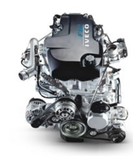
3.0-litre FIC Compressed Natural Gas engine